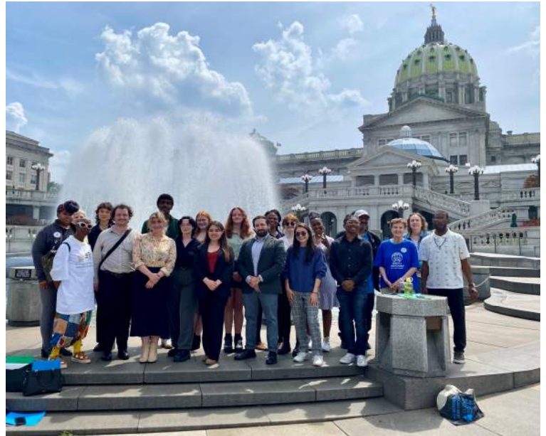
Clean Water Action activists pose in front of PA capitol after a day of lobbying for environmental justice.