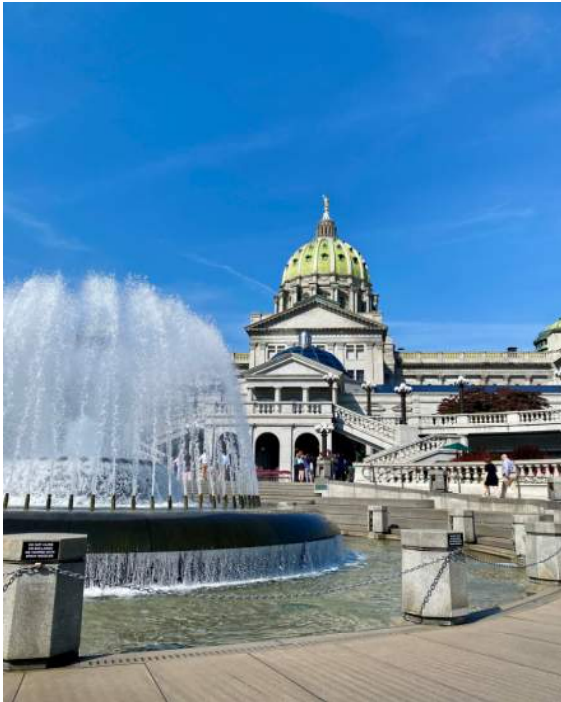
Fountain at the Commonwealth of Pennsylvania Capitol Building in Harrisburg PA