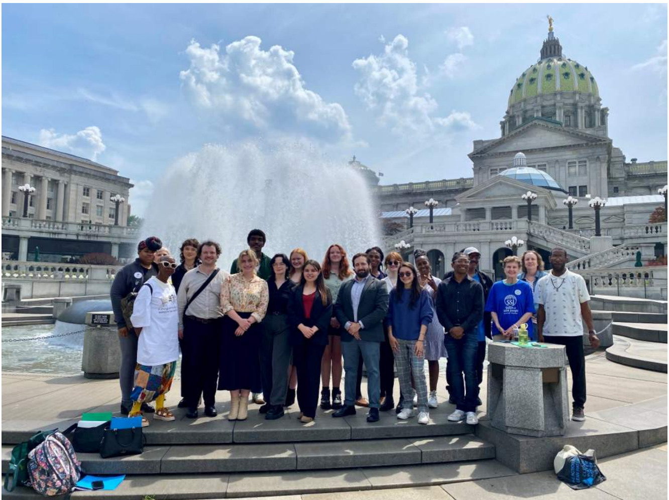
Some of the Clean Water Action and Environmental Justice activists pose before boarding the bus back to Philadelphia.

To request a speaker on Environmental Justice for your parish climate ministry, contact laudatosiomc@gmail.com